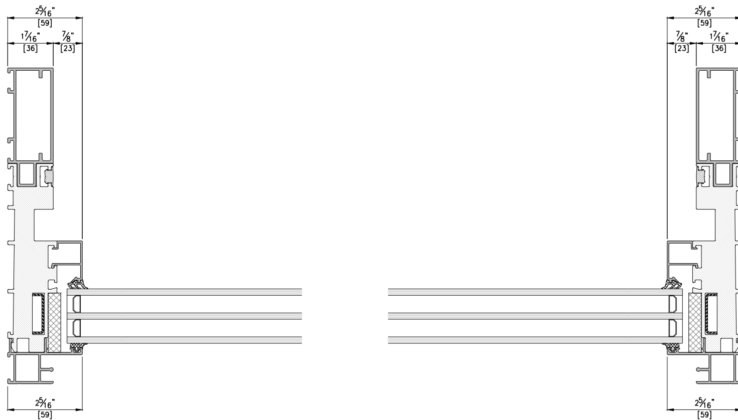
HORIZONTAL SECTION DETAIL A-A' SCALE : 1/3